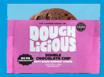
DOUBLE CHECOLATE CHIP