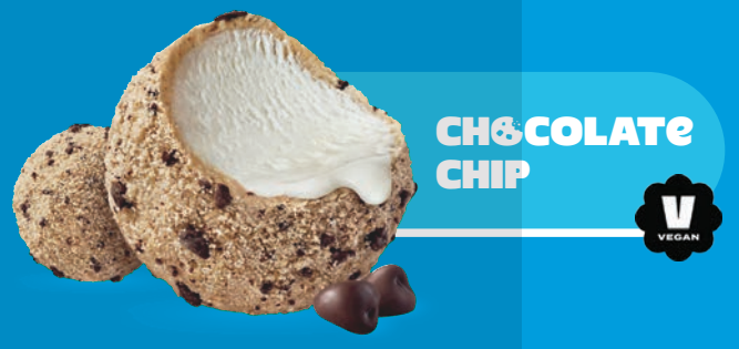
PACK SIZE: 6 bites x 16 per case CASES PER PALLET: 126