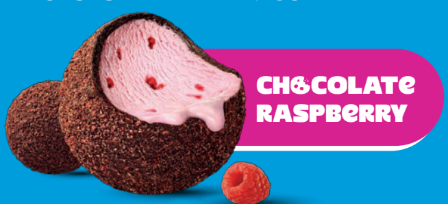
PACK SIZE: 6 bites x 12 per case CASES PER PALLET: 136