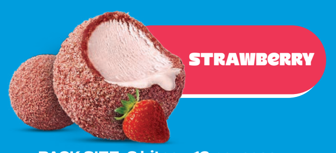
PACK SIZE: 6 bites x 12 per case CASES PER PALLET: 136