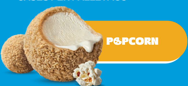
PACK SIZE: 6 bites x 12 per case BITES ARE CASES PER PALLET: 136