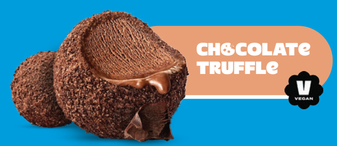
PACK SIZE: 6 bites x 12 per case CASES PER PALLET: 136

PACK SIZE: 2 bites x 16 per case CASES PER PALLET: 280