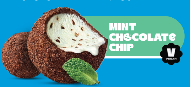
PACK SIZE: 6 bites x 12 per case CASES PER PALLET: 136