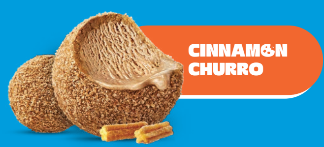
PACK SIZE: 6 bites x 12 per case CASES PER PALLET: 136